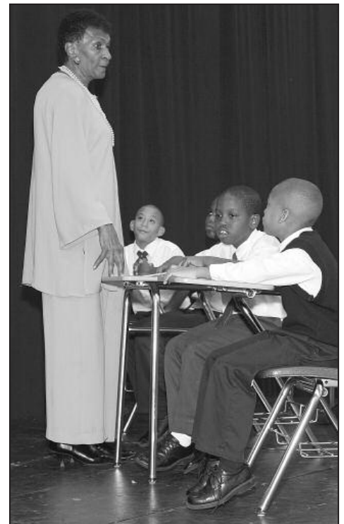
Marva Collins, keynote speaker, provides a teaching demonstration with students from Holy Family Lutheran School.