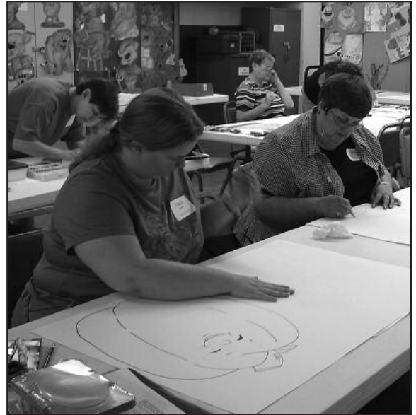
Look who is drawing and coloring now – the teachers!

Thanks to the Christopher Family's grant, every fifth and sixth grade class in our schools has the opportunity to attend. Twenty CLEF schools have already scheduled their retreats and four more still have to select dates. The cost of sending a child to camp involves not only the camp fees, but also transportation and supplies that many of our students don't own or have easy access to, such as: flashlights, sleeping bags, rain suits, and warm boots. If you would like to be a part of sending these students to Walcamp, a $25 contribution will cover a souvenir pack of a sweatshirt, cap, and snacks, or help alleviate the programming costs. ☀