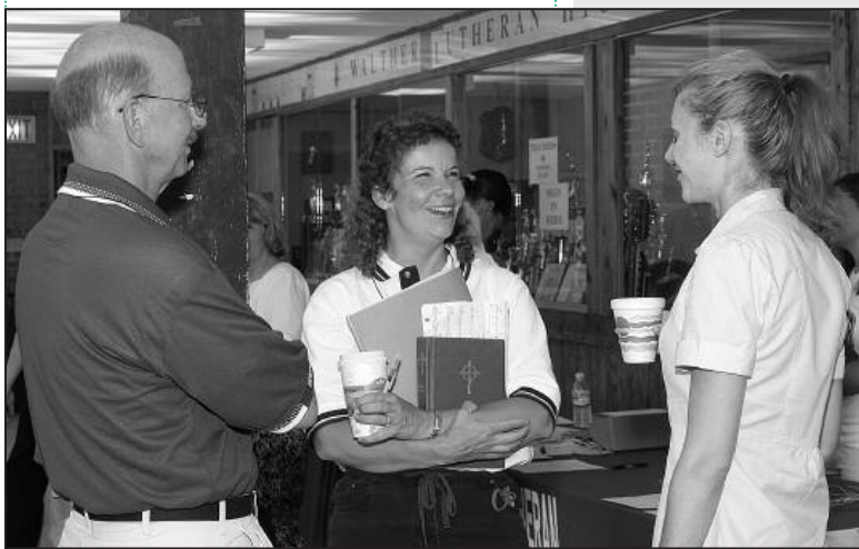
Catching up with friends and sharing experiences make for special moments during the Networking Conference.

Resources were available from a wide variety of vendors on hand. The conference was a huge success and a great launch to the school year. Attendees were left with the same challenge that Marva Collins gave her students every day – what phenomenal thing am I going to achieve today to make the world a better place? ☀