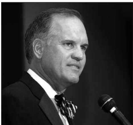
Above: Ryne Sandberg responded to audience questions during his keynote presentation.