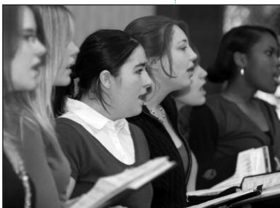
Left: Students from the Luther North Choir provided special music for the evening.